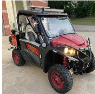
318 Grass Fire Utility