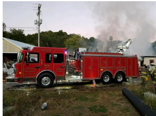
316 Snorkel / Tanker