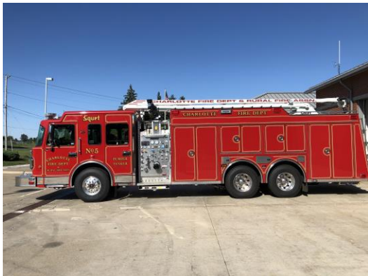
315 Snorkel / Tanker