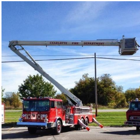
317 Snorkel / Antique