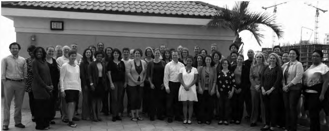
Spring 2014 Leadership Program Cohort at the kickoff training in Fort Lauderdale, FL.

The Leadership Program is a transformative experience for communities – it provides a springboard for civic engagement, cross-agency coordination, integrated budgeting and performance management, partnerships with philanthropy, and economic development.